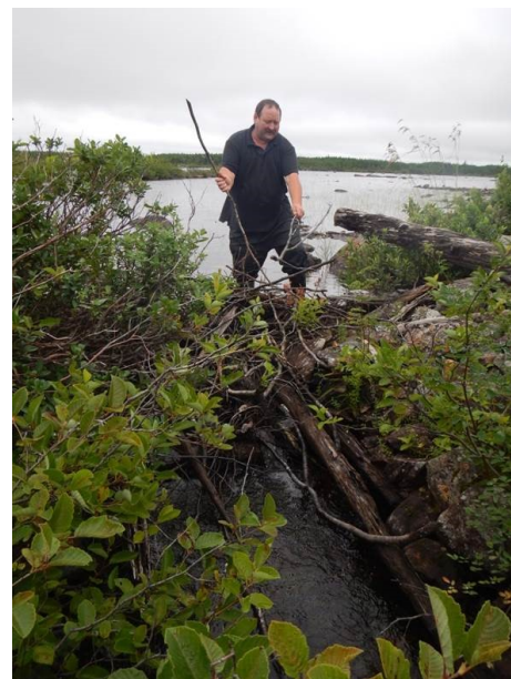
Removing blockages at the Moccasin Pond Brook